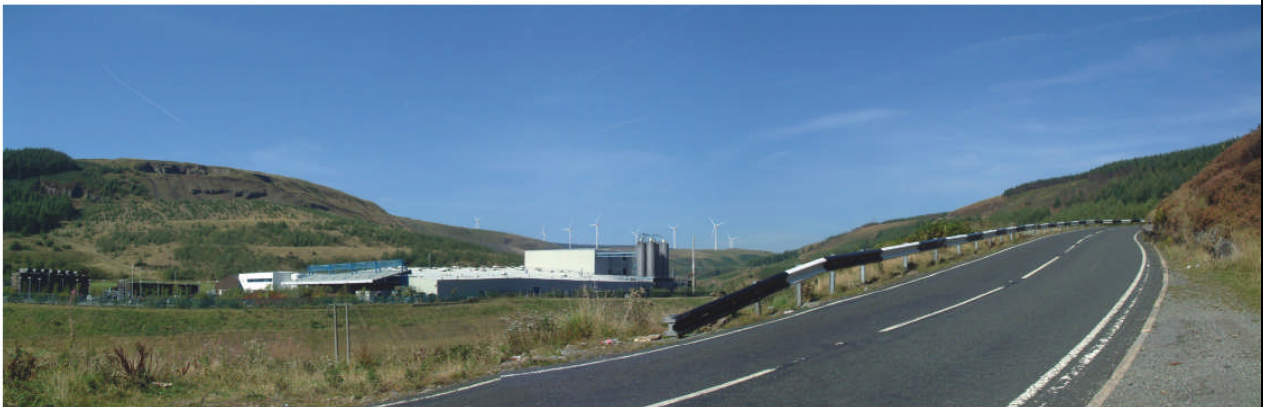
View of 12 turbine layout from A4233, Maerdy

Yn dilyn yr ymgynghoriad cyhoeddus, os yw'r astudiaethau amgylcheddol yn gadarnhaol, rhagwelir y bydd y prosiect terfynol yn cael ei gyflwyno i'r awdurdod cynllunio yn ystod y Gwanwyn 2006.