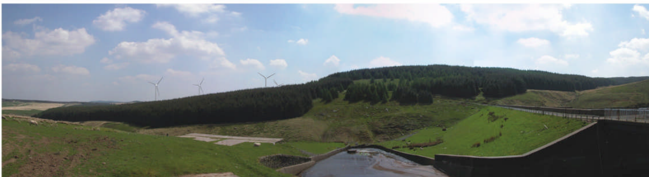
View of 8 turbine layout from Luest-wen reservoir

Following the public consultation, if the environmental studies are positive, it is anticipated that a final project would be presented to the planning authority in the Spring of 2006.